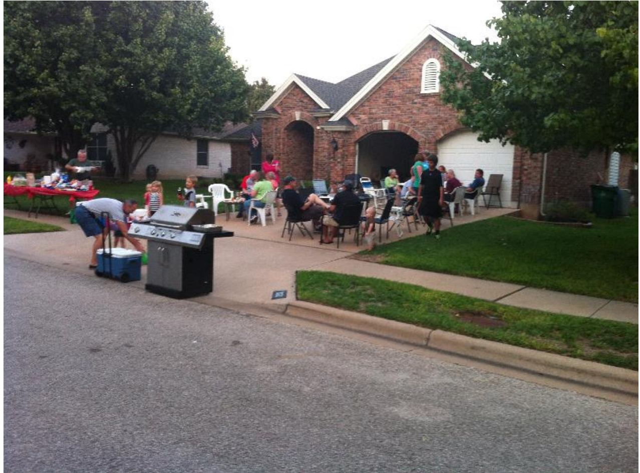
Rocky Creek Drive