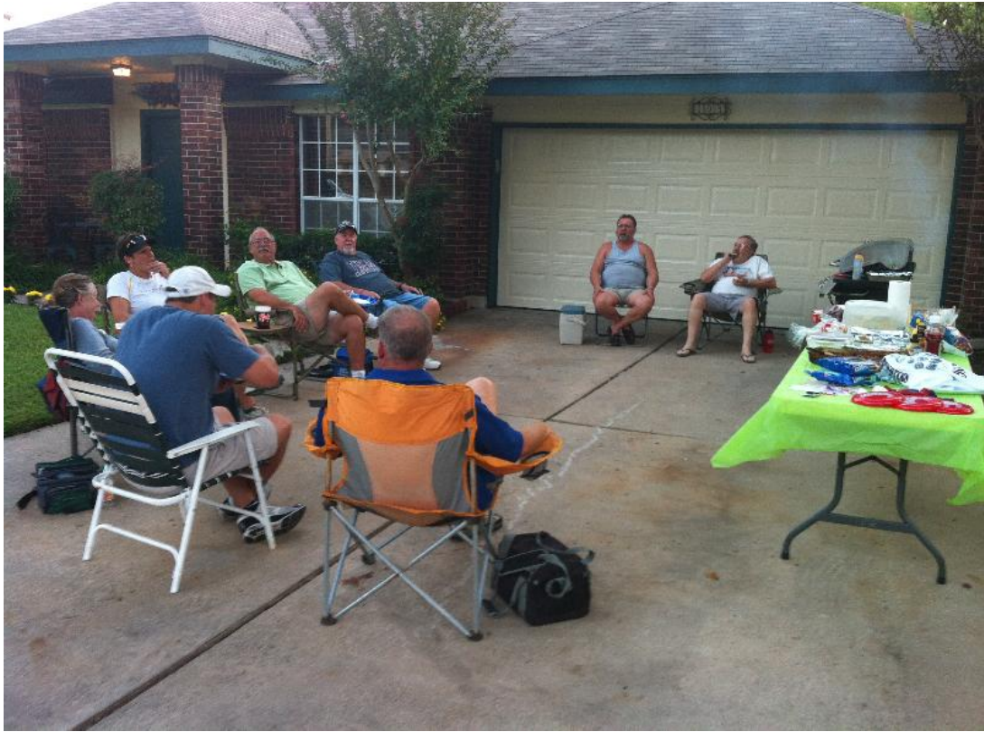
Split Oak Drive